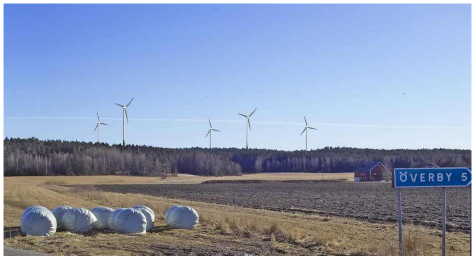
Figure 6. A photomontage over the five wind turbines planned at Lursäng. (Photomontage from the EIA of the Lursäng project).

The Lursäng-area is located at the border to Strömstad municipality, where an adjacent cultural heritage area has been designated an area of local significance. The cultural heritage area features several cairns, tumulus and tombs from Bronze and Iron Age. The municipality authorities of Strömstad have committed themselves to preserve and care for the area, but they have not done anything so far. The wind turbines and the new roads leading to them, will not affect the area physically but there will be a visual impact and the noise will affect the area. The officials working with the municipality's wind power plan realised this and at an early stage in the process demanded an assessment of the possibilities of compensating the impact. The public and authority consultation and design of the individual wind farm runs parallel with the proceeding wind power plan. Therefore, the experiences of the consultations in the individual project merge into the larger process in which the municipality operates. Compensation measures for impact on cultural heritage were therefore later included in the adopted wind power plan.