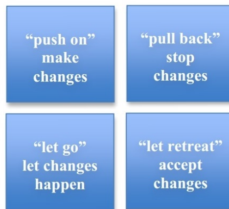
Figure 3. Strategies among stakeholders in community planning processes.

Depending on their role as key players in the community planning, the stakeholders will adopt different strategies along the way when dealing with matters concerning compensation. With inspiration from von Wright (1963), we can find four different strategies towards compensation among key players (Figure 3). They can push on and support the use of compensation in cultural heritage; pull back compensation proposals in planning processes; let the proposals become conditions for implementing construction projects; or retreat from this demand.