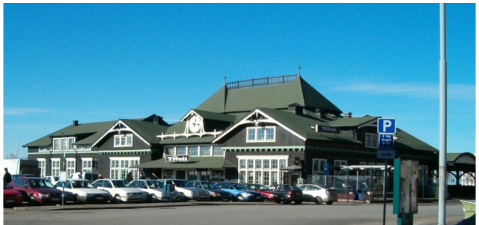
Figure 7. The Steam Ferry Station in Helsingborg.

A large part of the discussion during the workshop was about whether a map with information, downloadable from the internet, could be seen as a compensation measure, and in that case how does it fit into our model (Figure 1)? Heritage managers have a special relation to conservation as well as authenticity , and it was very clear that the proponents for the heritage management point of view were not satisfied with the category different type of value on the same and/or different site . At the same time, those with a background in architecture had solutions in the early design of the wind farm. If the wind turbines were placed in another way, could this not be seen as compensation? The participants emphasized the importance of the municipality's wind power plan, but they also mentioned that the officials lacked professional knowledge about cultural heritage. This is a common occurrence. A majority of the Swedish municipalities lack staff with practical and theoretical understanding of current cultural heritage issues.