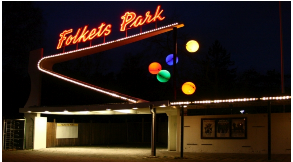
Figure 4. The entrance to the People' Park in Linköping at night

The first case study presented is about the development of the People's Park area in Linköping (Rönn, 2014). People's Parks (Folkets park), as a concept, evolved during the 1900s as a re-creational area for the emerging labour movement. They are found in nearly every town in Sweden and are a sort of public recreation space or amusement park (figure 4). In the beginning of the 21st century, the Folkets park had had its day as a place for entertainment for large parts of the society. But the setting still tells the visitor about the struggling labour movement, the developing democratic society and the modernistic 1900s.