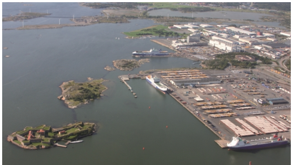
Figure 5. The Port of Gothenburg with the fortress Nya Älvsborg and the two islands of Stora and Lilla Aspholmen.

The workshop evaluating the case (Håkansson, 2015) showed us that even the detailed development plan is a vague instrument since the area had already been identified as a good spot for development. Maria Håkansson believes that the comprehensive plan is a much better tool to apply in order to avoid negative impact on cultural heritage. If the authorities at Linköping municipality had worked with compensation measures within its comprehensive plan, it would probably have led to a more transparent process. Instead, financial instruments control the process in Linköping. Through the voluntary agreement with the municipality, the developer is obliged to pay for the relocation of a building and renovation of another (Rönn, 2014a).